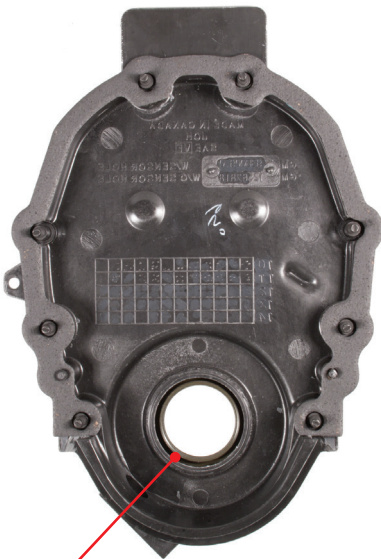
Timing cover seal is included.

This MAHLE Original gasket set is available for the following applications: