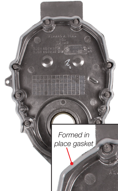
Formed in place gasket