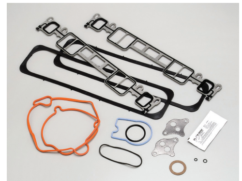
MAHLE Original V8 Manifold Installation Set (V6 Sets Also Available)

In addition, MAHLE Original has a new line of Manifold Installation Sets (MIS) for late model GM vehicles. The new MIS kits include all of the gaskets and other items needed for a technician to properly service the intake manifold.