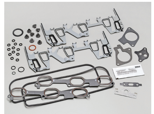
MAHLE Original 3.1L & 3.4L Manifold Installation Set

In addition, MAHLE Original has a Manifold Installation Set (MIS) for the GM V6 engine. The MIS kit includes all of the gaskets and other items needed for a technician to properly service the intake manifold.