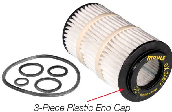
3-Piece Plastic End Cap